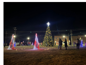
Scenes of Lights

Scenes from the Annual Tree Lighting Festival in Yanceyville on December 6, 2024.