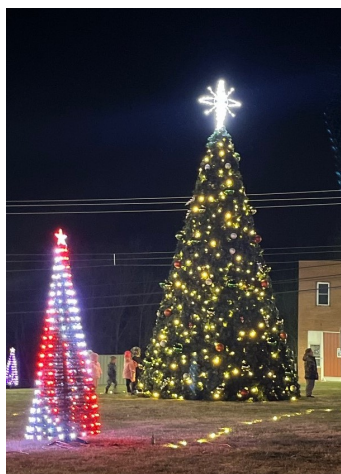
The CCHA Town Tree