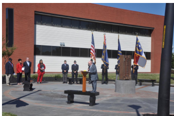
9-11 Yanceyville Memorial Dedication Ceremony