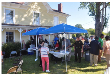
Refreshments provided by the Town of Yanceyville at the