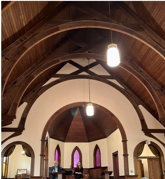
Inside Christ Church - The Jean Bradsher Scott Renaissance Center

Museum Annex for the Milton Renaissance Museum & Visitor Center.