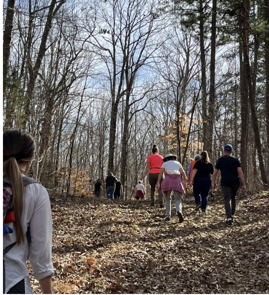
Group Hiking at Will Paylor Horse Trail in the Caswell Game Lands

https://www.youtube.com/watch?v=vT-0A9j0DAk