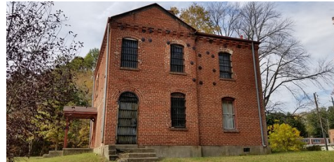
The Caswell County Historical Jail in need of repair