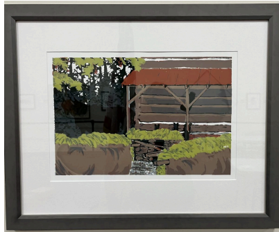
Dinnertime On display at Yanceyville Museum of Art

Maud Gatewood (1934–2004) is an exceptional figure in the art history of North Carolina and the American Southeast. A painter of exacting technique with a keen eye for composition and cultural commentary, her pictures capture the Carolinas (and the expanding world beyond) across much of the 20th Century. A native of Yanceyville in Caswell County, NC, Gatewood's paintings reveal rural landscapes and their denizens in the midst of transformation while also cleverly framing the experience of modern life with acerbic wit and a surprising wealth of empathy. Learn more about the exhibit by clicking here .