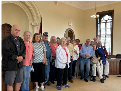
Organ Church Senior Citizen Group, Salisbury, NC

The historic jail is in need of repair and the CCHA is looking for grant opportunities to help. This is a treasure that often is overlooked as it sits behind the historic courthouse. The jail was used until 1973 and the sheriff and his family lived in the building too on the first floor! The jail is one of the only jails left in NC with gallows included, however they were never used due to the change in laws.