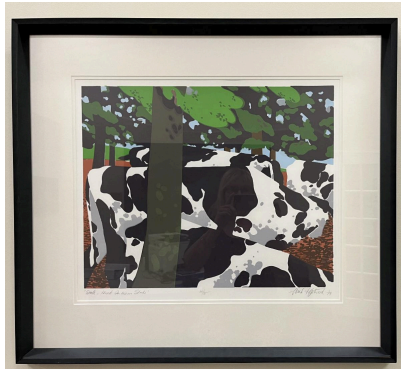
Spots - Herd in Shade (1979) On display Yanceyville Museum of Art